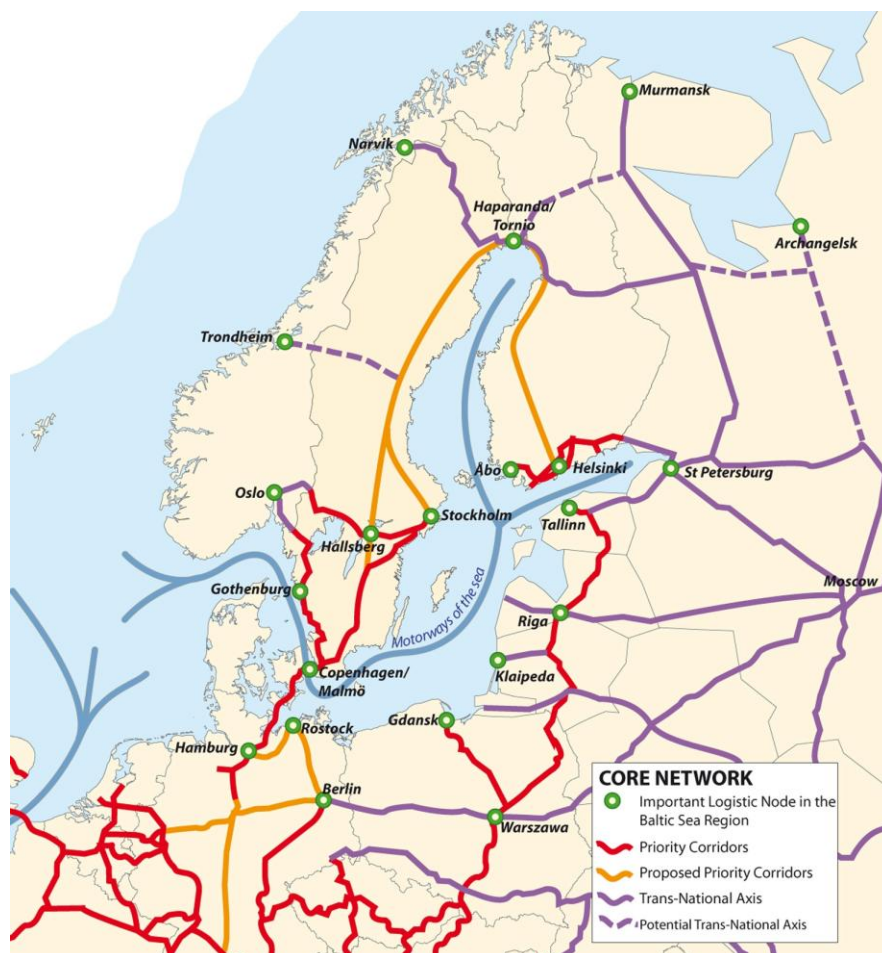
Figure 2: Existing and proposed railway core network corridors and main nodes.

We also stress the importance of third country port nodes to be included in the core network, such as Trondheim and Narvik.