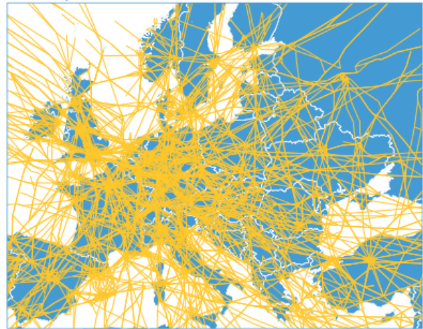
→ Europe's Air Service Network

Exemption to this general principle is that some airports can continue to receive operating aid. This assumes that the airport is declared as a SGEI Airport (Services of General Economic Interest), i.e. it produces a service of general economic interest. In order to receive this status, strict conditions need to be met. Compensations for public service granted to airports above the 200.000 passengers threshold will have to be notified by the Member State concerned and approved by the EC. In its draft Guidelines, the EC considers that "it is possible for the overall management of an airport, in well-justified cases, to be considered an SGEI (...), this can only be the case if part of the area potentially served by the airport would be, without the airport, isolated from the rest of the EU to an extent that would prejudice its social and economic development. Such an assessment should take due account of other modes of transport, and in particular of high-speed rail services or maritime links served by ferries".